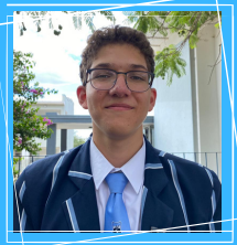
EDITOR: JADON JOOSTE

Countless photos were taken and hugs were given as this special chapter came to a close.